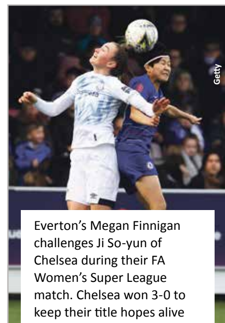
Everton's Megan Finnigan challenges Ji So-yun of Chelsea during their FA Women's Super League match. Chelsea won 3-0 to keep their title hopes alive