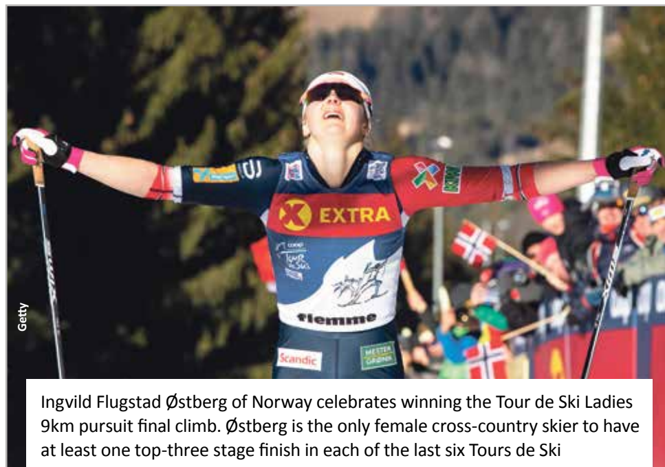
Ingvild Flugstad Østberg of Norway celebrates winning the Tour de Ski Ladies 9km pursuit final climb. Østberg is the only female cross-country skier to have at least one top-three stage finish in each of the last six Tours de Ski