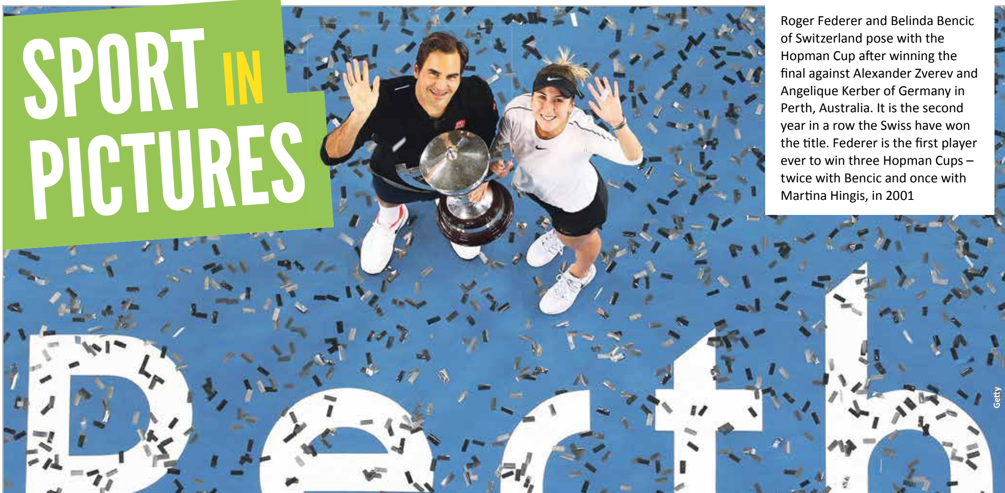
Roger Federer and Belinda Bencic of Switzerland pose with the Hopman Cup after winning the final against Alexander Zverev and Angelique Kerber of Germany in Perth, Australia. It is the second year in a row the Swiss have won the title. Federer is the first player ever to win three Hopman Cups – twice with Bencic and once with Martina Hingis, in 2001