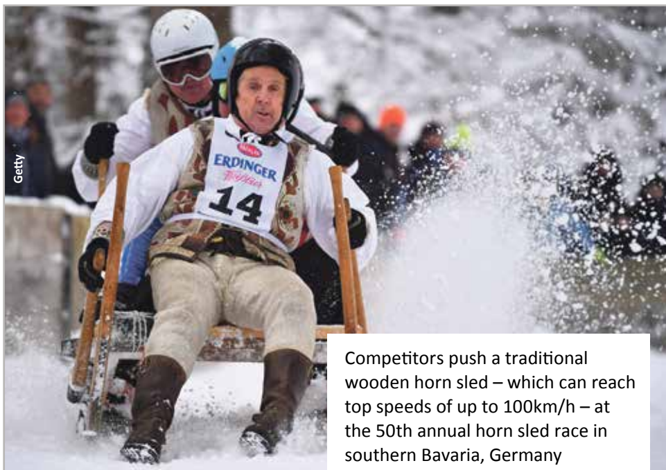
Competitors push a traditional wooden horn sled – which can reach top speeds of up to 100km/h – at the 50th annual horn sled race in southern Bavaria, Germany